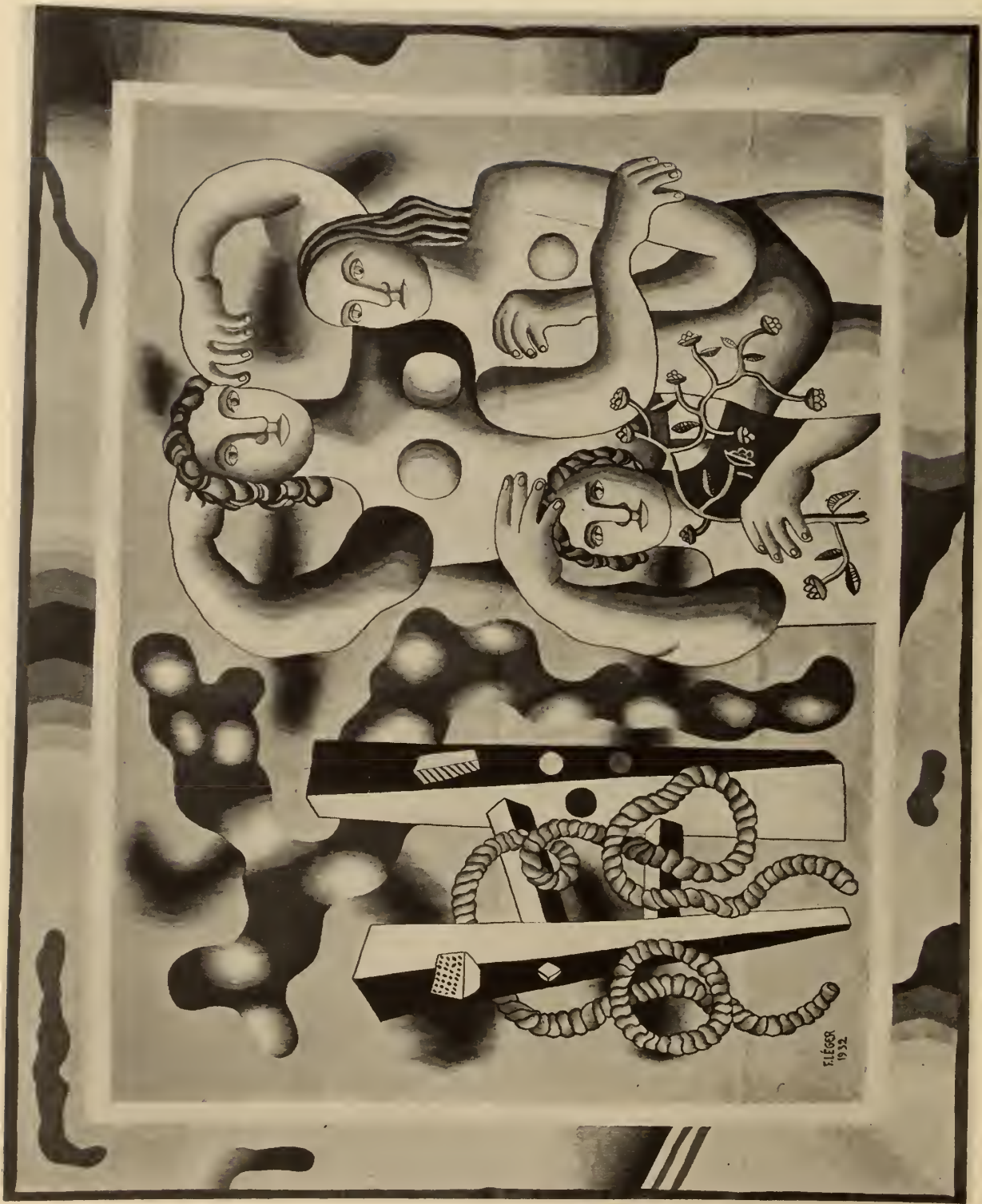
FERNAND LEGER — "Trois Personnages"